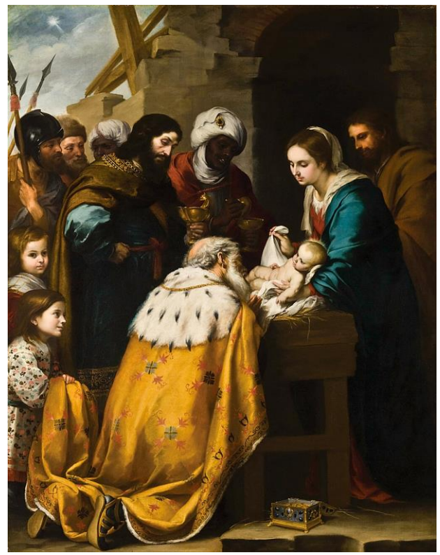
Adoration of the Magi by Bartolomé Esteban Morillo, c. 1655

As the season of Christmas draws to a close, we look forward to the celebration of Epiphany this Saturday. Though we will not have an Epiphany mass here, I encourage you to mark the day in your own way at