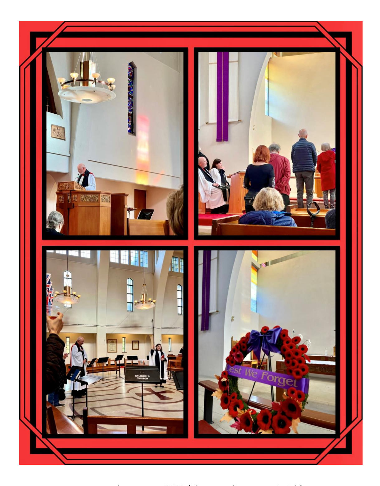
Remembrance Day 2023