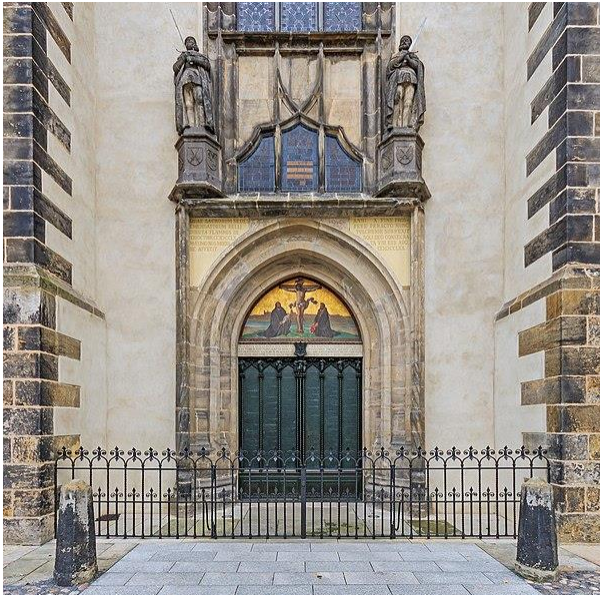
“Door of the Theses” in Wittenberg

On Tuesday, we observe Reformation Day—a day to honour the saints of the Reformation era who helped shape the Church we have inherited. The celebration falls every year on the anniversary of Martin Luther’s nailing of the Ninety-five Theses to the door of All Saints Church at Wittenberg on October 31, 1517.