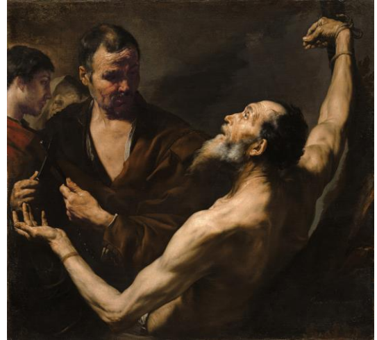
The Martyrdom of Saint Bartholomew by Jusepe de Ribera (1634)

Stories about his death differ. Some say he was thrown into the sea to drown; others, that he was crucified upside down like St. Peter. But the most well-known narrative holds that he was skinned alive and then beheaded. For this reason, his emblem in Christian art is the flaying knife. Bartholomew is the patron saint of tanners, plasterers, tailors, leatherworkers, bookbinders, farmers, housepainters, butchers, and glove makers.