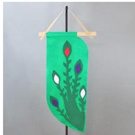
Green Growing Banner