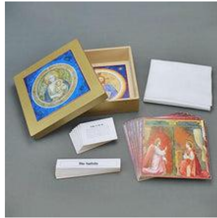
The Mystery of Christmas