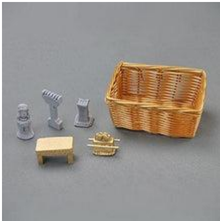
The Ark and the Temple (some things)