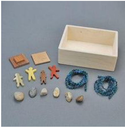
The Great Family