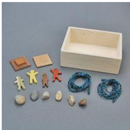
The Great Family