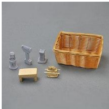
The Ark and the Temple (some things)