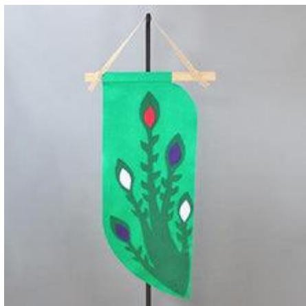
Green Growing Banner