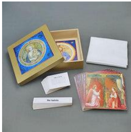
The Mystery of Christmas