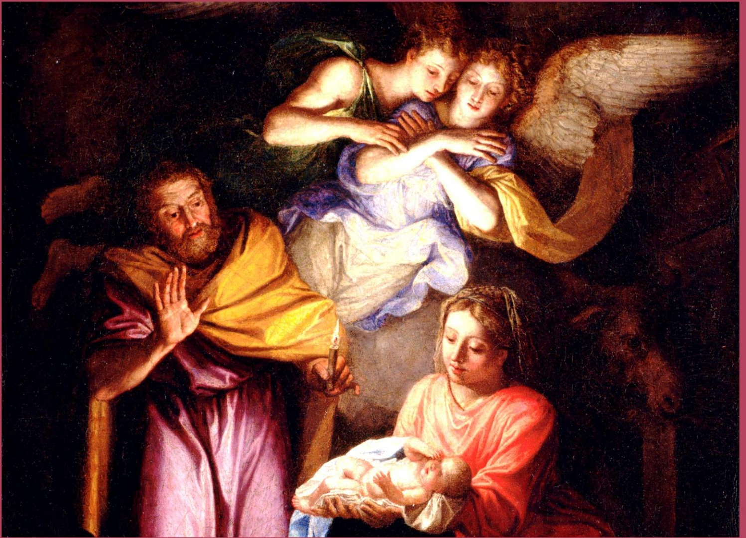
The Nativity by Noel Coypel