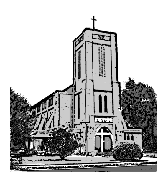
Parish of St John's (Shaughnessy)